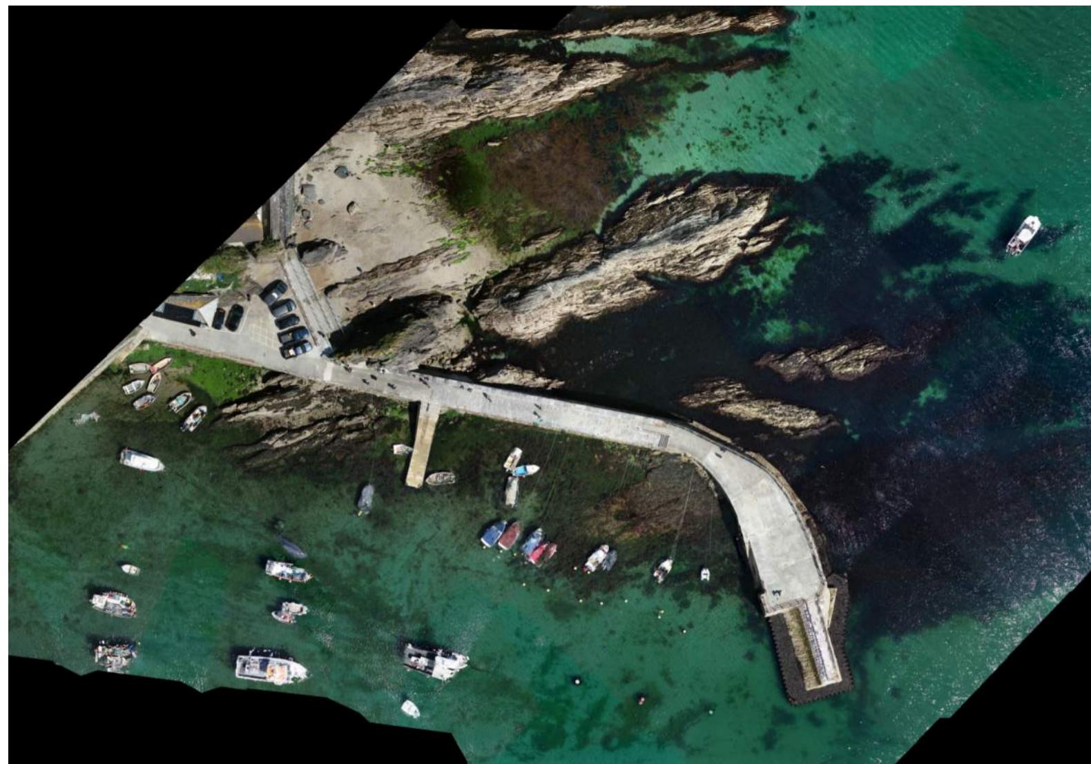
MEVAGISSEY HARBOUR - OUTER NORTH BREAKWATER NOT TO SCALE (REPRODUCED WITH THE PERMISSION OF SHORELINE SURVEYS LTD)