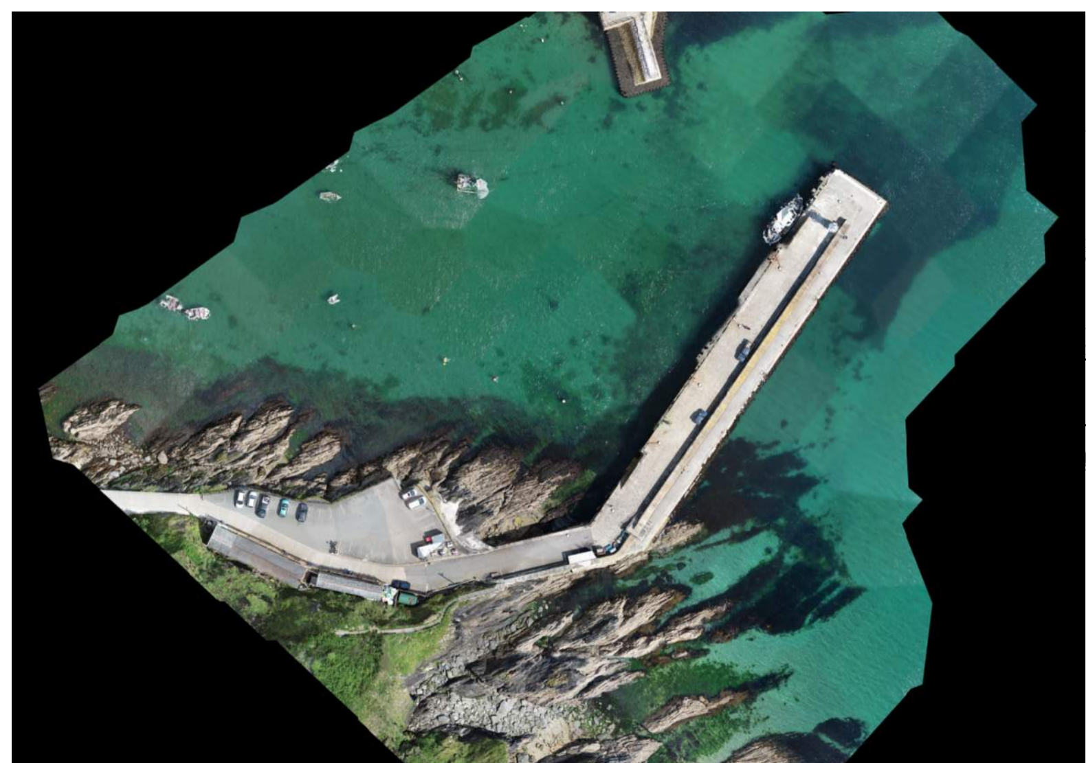
MEVAGISSEY HARBOUR - OUTER SOUTH BREAKWATER NOT TO SCALE (REPRODUCED WITH THE PERMISSION OF SHORELINE SURVEYS LTD)